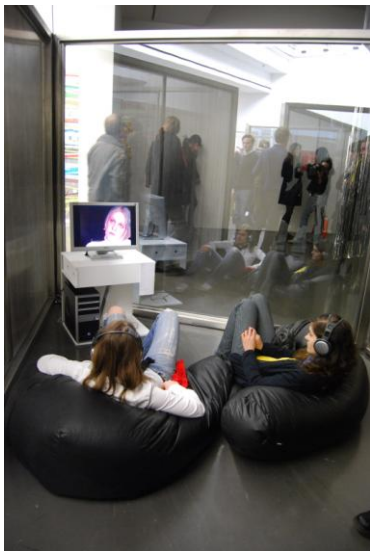
Dan Graham Pavilion for travelling Sonic Youth exhibition Sensational Fix, 2008-2009