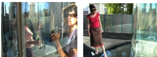
Dan Graham Ying/Yang Pavilion , 2003 tempered glass, steel, gravel, and water 2.1 x 3.35 x 3.35 meters commissioned with MIT Percent-for-Art Funds, List Visual Arts Center, Massachusetts; installed at Simmons Hall, MIT Campus