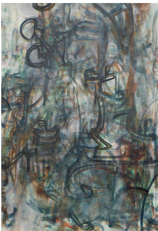
Nobuya Hoki "Untitled", 2019 Oil on canvas 130.3 x 89.4 cm © Nobuya Hoki

Tue-Sat 11:00-19:00 Closed on Sun, Mon, and National Holidays