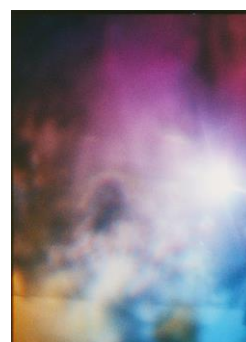
Hanayo “Untitled” , 2017 C-print Image size: 84 x 60.1 cm Paper size: 90.3 x 68.3 cm