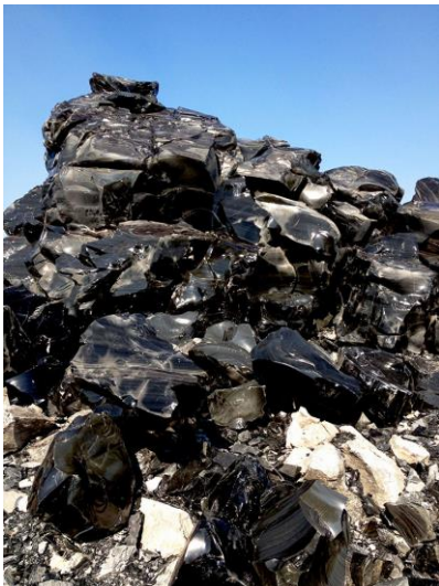
Ellie Omiya "Obsidian Mountain", 2012 C-print © Ellie Omiya