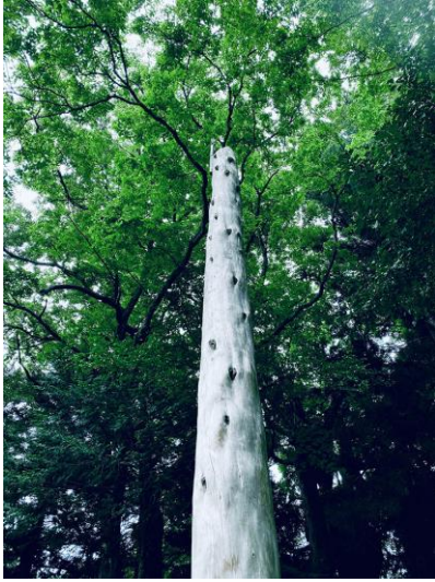
Ellie Omiya "Onbashira I", 2020 C-print

Gallery hours: 12:00-18:00 Closed on Sun, Mon and National holidays