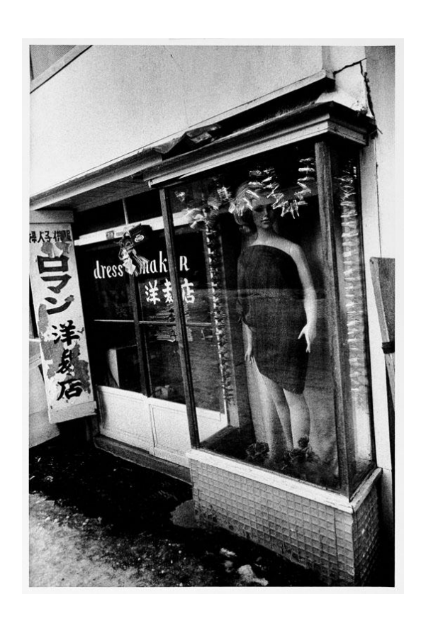
Daido Moriyama "Tsugaru", 2010 B & W print 41.8 x 28.3 cm