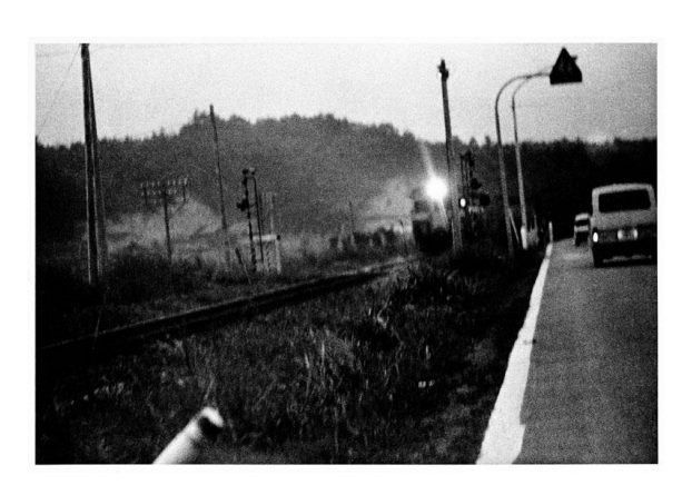
Daido Moriyama "Tsugaru", 2010 B & W print 28.3 x 41.8 cm