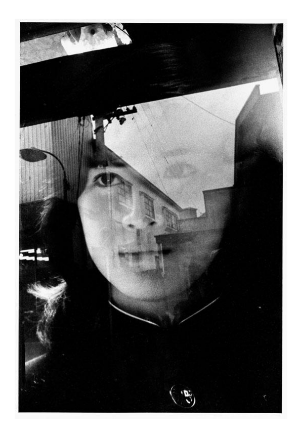
Daido Moriyama "Tsugaru", 2010 B & W print 41.8 x 28.3 cm