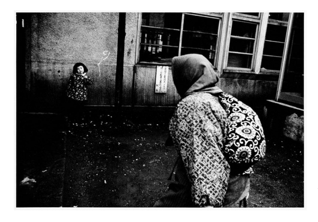
Daido Moriyama "Tsugaru", 2010 B & W print 28.3 x 41.8 cm