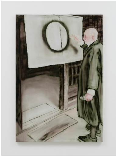
Shogo Harada, "Untitled (Noren)", 2026 Oil on canvas 160.3 x 110 cm