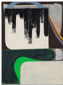
Erwin Bohatsch "Untitled", 2023 Acrylic, oil on canvas 135 x 100 cm

Tue-Sat 11:00 – 19:00 Closed on Sun, Mon, and National Holidays