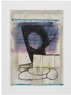
Erwin Bohatsch "Untitled", 2020 Mixed media on paper 29.7 x 21 cm