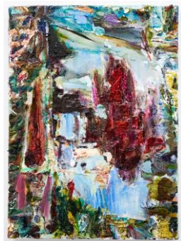
Masanori Tomita "cap", 2019 Oil on canvas 33.3 x 24.2 cm © Masanori Tomita Courtesy of KAYOKOYUKI