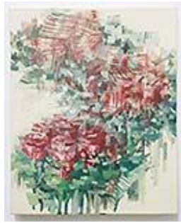
Reina Mikame "Flower Stall", 2019 Oil on canvas 27.3 x 22 cm © Reina Mikame Courtesy of Yutaka Kikutake Gallery