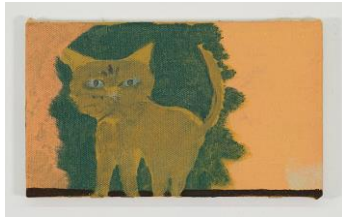
Yu Nishimura "enemy line", 2021 Tempera on canvas 16.3 x 27.4 cm © Yu Nishimura Courtesy of KAYOKOYUKI