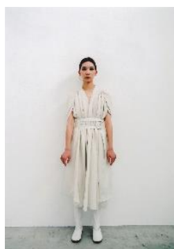
2019 FW COSMIC WONDER “Harmonic Meditation”