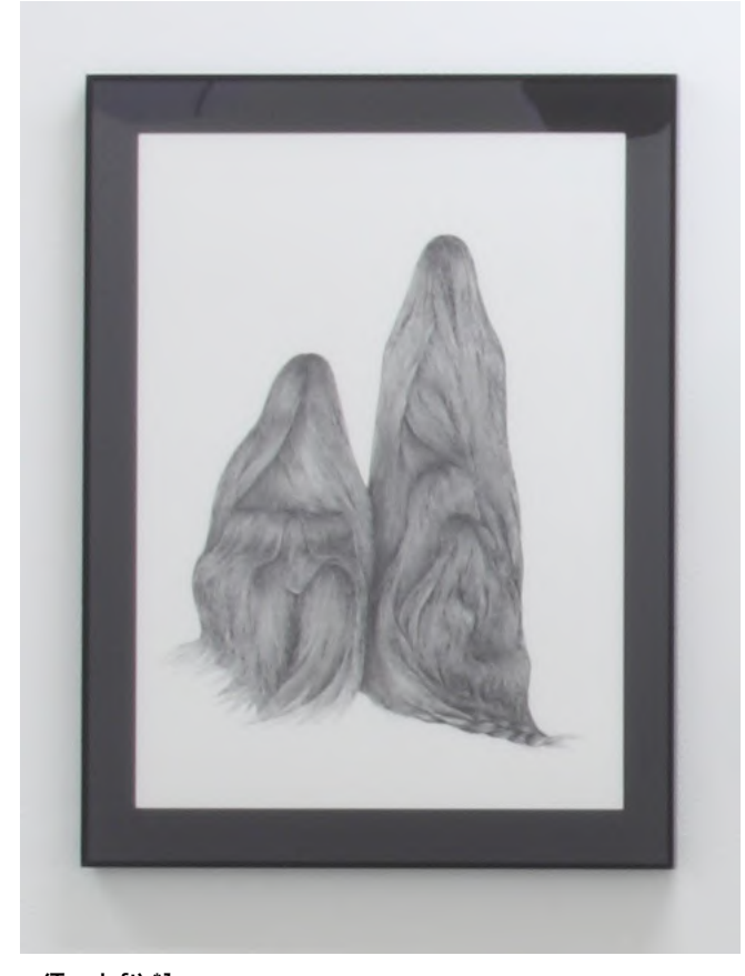
(Top left) *1 Syagini Ratnawulan Family portrait, 2011 77 x 57cm Technical pen drawing on paper

(Top right) *2 Gor Soudan minimal tension 1/6, 2014 36 x 36cm Protest wire