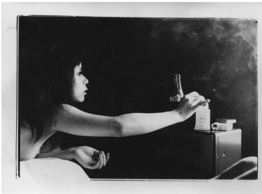
Nobuyoshi Araki "Theater of Love" c.1965 B & W Print print size: 12.1 x 16.4 cm