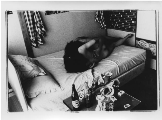
Nobuyoshi Araki "Theater of Love" c.1965 B & W Print print size: 12.1 x 16.4 cm