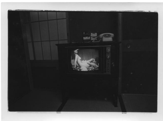
Nobuyoshi Araki "Theater of Love" c.1965 B & W Print print size: 12.1 x 16.4 cm