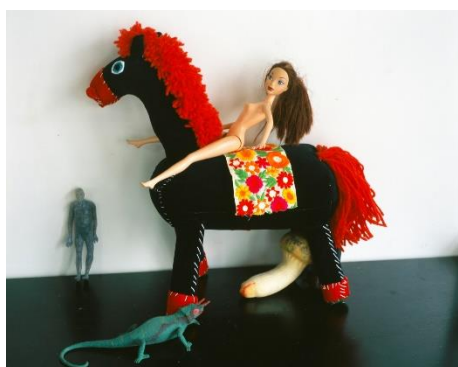
Nobuyoshi Araki "A Desktop Paradise", 2016 RP-Pro Crystal print Image size: 32.4 x 40.5 cm Paper size: 35.6 x 43.2 cm © Nobuyoshi Araki