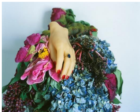
Nobuyoshi Araki "A Desktop Paradise", 2016 RP-Pro Crystal print Image size: 32.4 x 40.5 cm Paper size: 35.6 x 43.2 cm © Nobuyoshi Araki

contact@takaishiigallery.com Mardi - Samedi 12h -19h