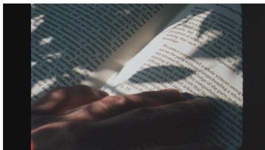
Luke Fowler & Toshiya Tsunoda

Location: Ftarri ( http://www.ftarri.com/suidobashi/index.html )