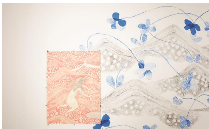
“10th Anniversary Exhibition: To Wander a Garden” installation view at Vangi Sculpture Garden Museum, Apr 21 – Aug 31, 2012

Kyoko Murase was born in Gifu City in 1963. She graduated from the Aichi Prefectural University of the Arts in 1986, where she also completed her postgraduate studies in 1989. She subsequently studied at the Kunstakademie Düsseldorf between 1990 and 1996, returned to Japan in 2016. She currently lives and works in Tokyo. Her major solo exhibitions include “park”, Taka Ishii Gallery, Tokyo (2019); “Painting and ... vol.3 Kyoko Murase”, Gallery αM, Tokyo (2018); “Fluttering far away”, Toyota Municipal Museum of Art, Aichi (2010); “Cicada and horned owl”, the Vangi Sculpture Garden Museum, Shizuoka (2007). She has participated in “„tomodachi to“. Mit Freund*innen”, Kunsthalle Düsseldorf, Düsseldorf (2021); “Living in Symbiosis with Forests and Water”, Nagano Prefectural Art Museum, Nagano (2021); “luxurious dialogue”, Okazaki Mindscape Museum, Aichi(2020); “Aichi Art Chronicle 1919-2019”, The Aichi Prefectural Museum of Art, Aichi (2019); “Pathos and Small Narratives: Japanese Contemporary Art”, Gana Art Center, Seoul (2011); “Red Hot: Asian Art Today from the Chaney Family Collection”, The Museum of Fine Arts, Houston (2007); “Roppongi Crossing”, the Mori Art Museum, Tokyo (2004); “MOT Annual 2002 – Fiction? Painting the reality in the Age of the Virtual –”, the Museum of Contemporary Art, Tokyo.