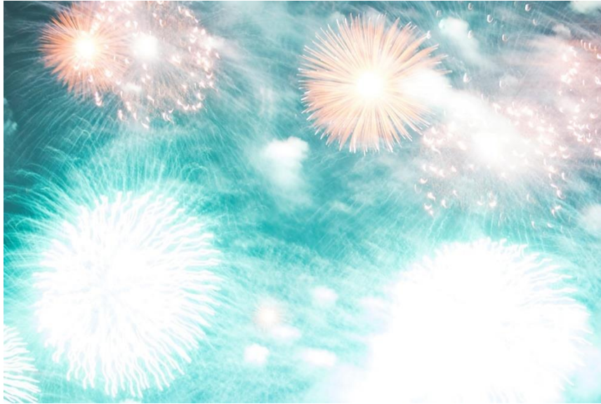
Mika Ninagawa, Light of , 2015, C-print mounted on Plexiglas, frame ©mika ninagawa

“We reach out our hands toward a trajectory of light and the moment we ask for help in catching that light in the frighteningly deep, blue, high sky, we sense happiness.”