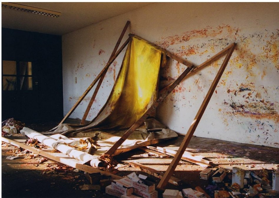
Masato Kobayashi, Unnamed #27 , 2002, oil, canvas, wooden frame

photo by Shizuka Kobayashi, ©Masato Kobayashi