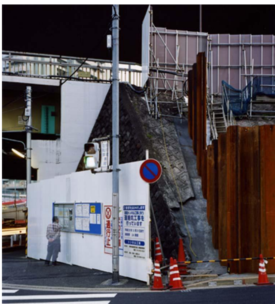
"Tracing Lines / Yamate-Dori #3418" 2008

web: www.takaishiigallery.com e-mail : tig@takaishiigallery.com Tue-Sat 12-19pm